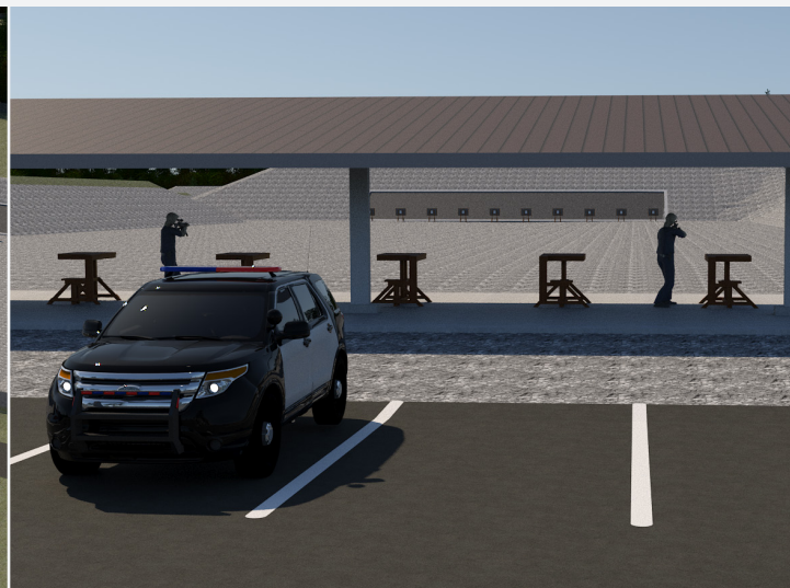
Above: Conceptual rendering of the final facility.