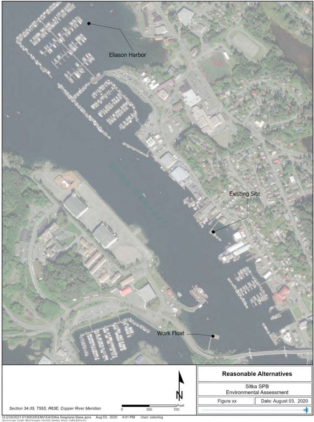
Figure A2: Alternatives Evaluated in 2012 DOWL HKM Study